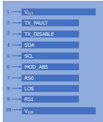
Bottom of Board