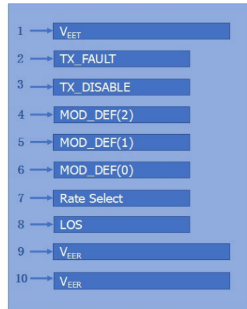
Bottom of Board