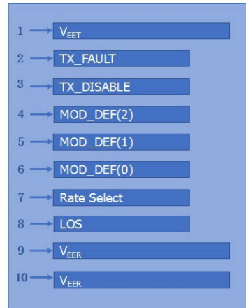
Bottom of Board