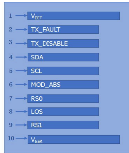
Bottom of Board