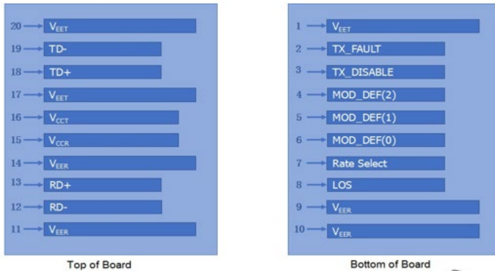
Pin-out of connector Block on Host board