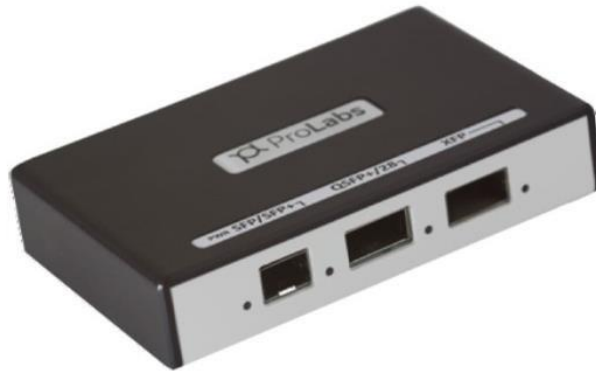
Figure 2 – ProTune™ appliance