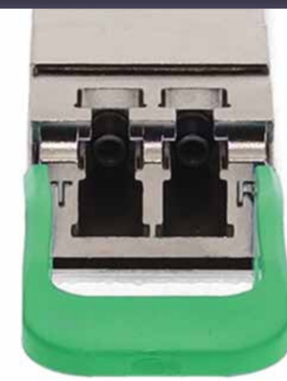
QSFP-DD FR4, LR4, LR8, ER8, ZR, Open ZR+

Cable Type: C-MPOMPO-10M9SM Connector Type: MPO-12 Fiber Type: Single-mode fiber Key Characteristics: Standard SMF angle polish MPO-12. Breakout or fan-out connections to single lambda 100G transceivers.