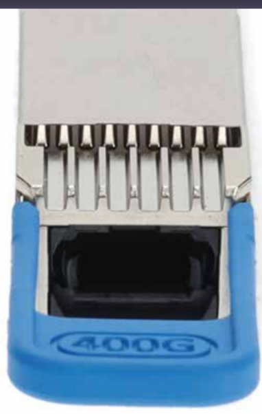
QSFP-DD DR4, DR4+, PLR4

Cable Type: C-MPOMPO-10M5OM5 Connector Type: MPO-12 Fiber Type: Multi-mode Fiber Key Characteristics: Standard MPO-12, optimized performance with OM5 fiber.